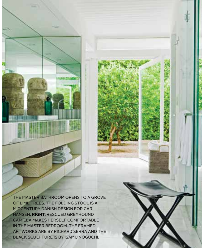
THE MASTER BATHROOM OPENS TO A GROVE OF LIME TREES. THE FOLDING STOOL IS A MIDCENTURY DANISH DESIGN FOR CARL HANSEN. RIGHT: RESCUED GREYHOUND CAMILLA MAKES HERSELF COMFORTABLE IN THE MASTER BEDROOM. THE FRAMED ARTWORKS ARE BY RICHARD SERRA AND THE BLACK SCULPTURE IS BY ISAMU NOGUCHI.